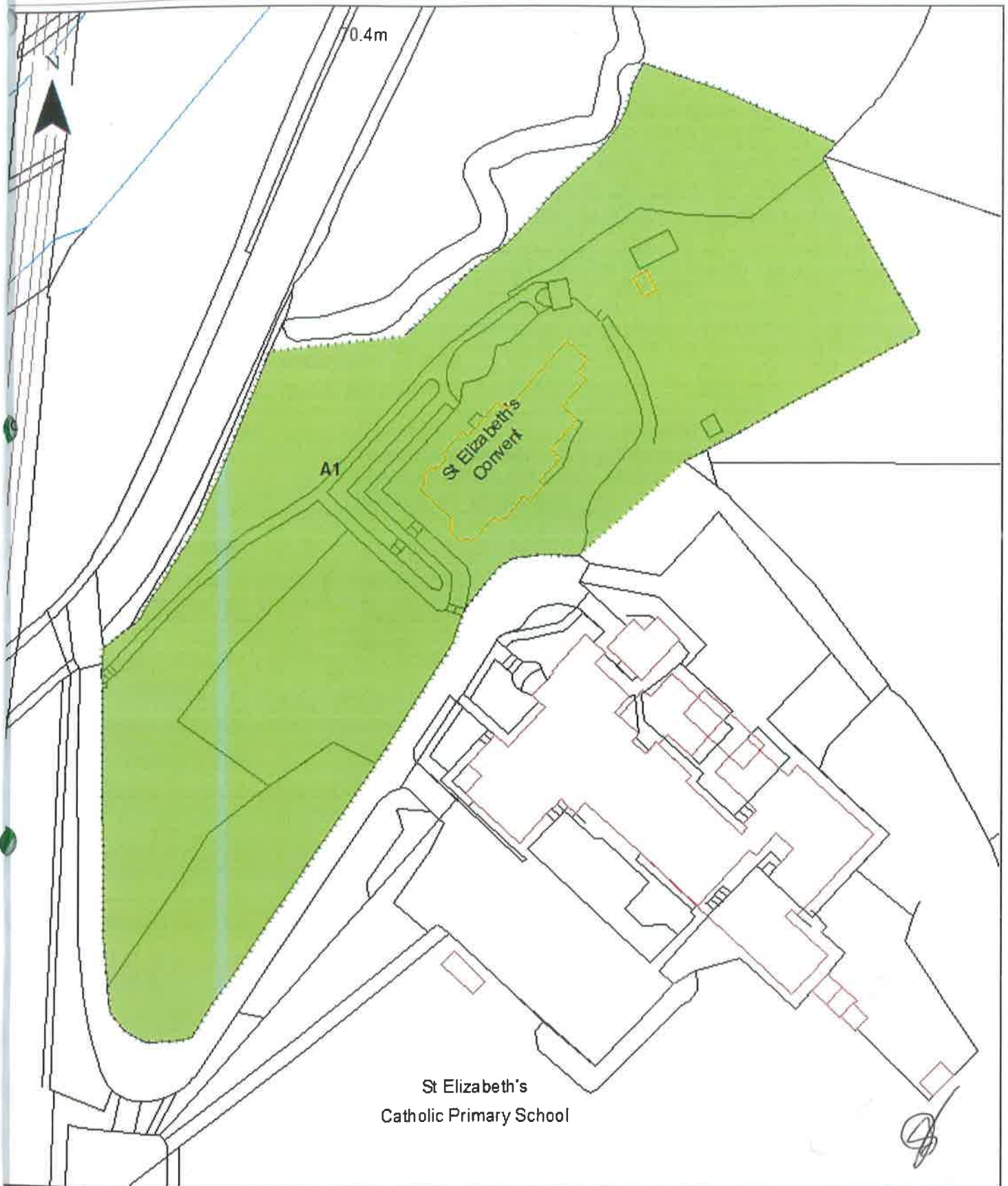
St Elizabeth's Catholic Primary School

Reproduced from the Ordnance Survey map with the permission of the Controller of Her Majesty's Stationery Office. St. George's Charities, Unincorporated. Reproduction in this document is prohibited without the prior written consent of the Controller of Her Majesty's Stationery Office. Licence No. 100021321 - 2017.