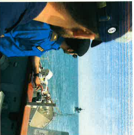
Royal Navy and Qatari Young Officers oversee Ships Conducting Officer of the Watch Manoeuvres with Qatari Emiri Navy

Whilst in Qatar the Ship's Company took advantage of some down time, taking part in a 5-a-side football tournament and reaching the semi-finals.