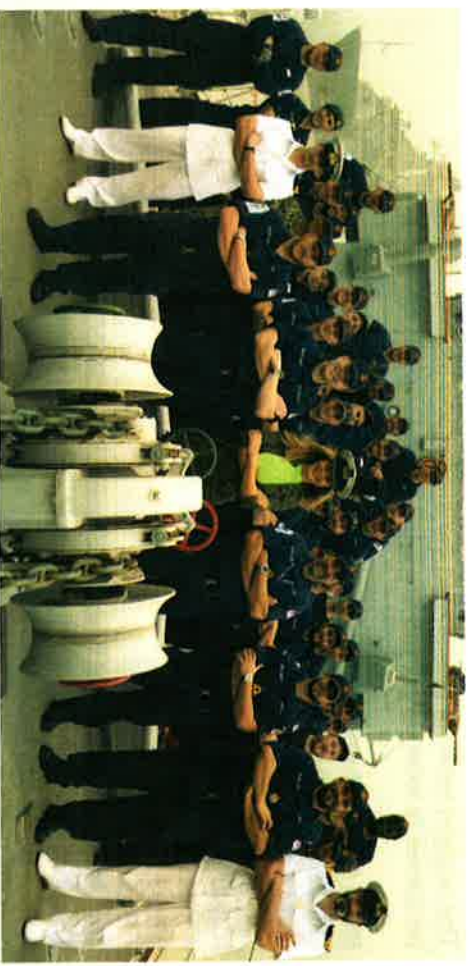
Carol Vorderman joins MCM 2 Crew 8 following a fantastic Bahrain Grand Prix

In April it was time for the much anticipated Operational Stand Down and a chance to relax; a reward for the unrelenting work ethic of the crew. From desert safaris to lounging by the pool, everyone took in the many sights and experiences the Arabian Metropolis has to offer.